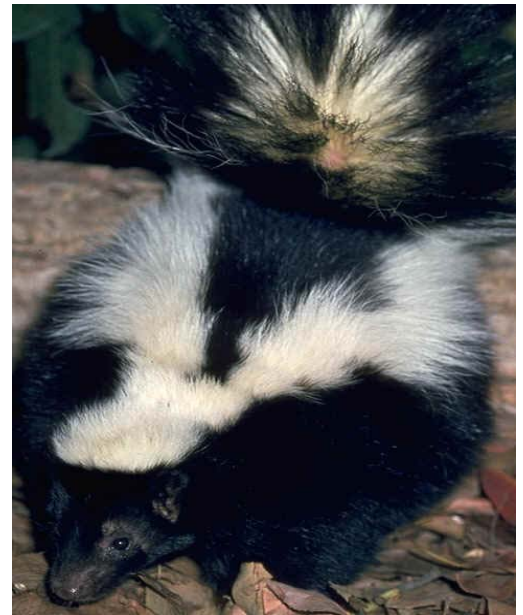
Figure 1. Striped skunk.

Identification. Striped skunks are easily identified by their prominent white stripes along the back, jet black fur, and large bushy tail. Adult skunks can be the size of a house cat (6-14 lbs). Striped skunks often have a prominent white stripe, but can range in color from nearly all white to nearly all black. The