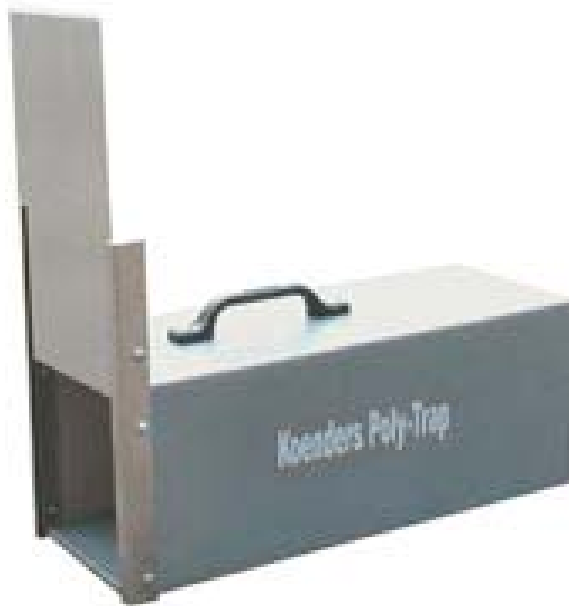
Figure 4. A spray proof skunk trap

near the den site for multiple nights to ensure that all skunks are captured. The traps can be baited with canned cat food, peanut butter, chicken, or fish scraps.