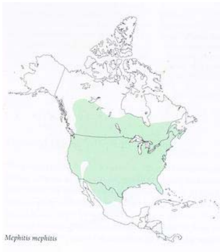
Figure 2. Range map of striped skunks in North America.

stripe can be a single strip from head to tail or can be split along the back into two stripes giving the skunk the appearance of having alternating white and black bands.